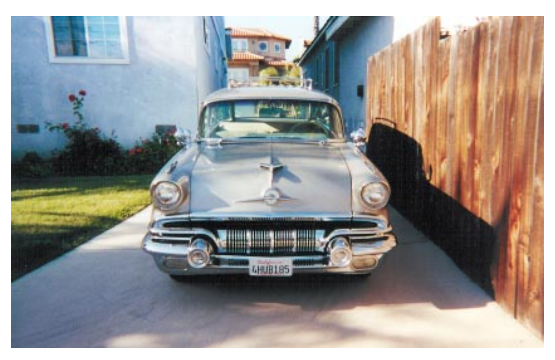
Marvin Morton's 57-2764DF Safari. The body number is CL 1260, pretty close to the last one made. Does anyone out there own one with a later number? Marvin's Safari is pretty much in original unrestored condition with Trim package 244, Paint code QQH, and Accessory group BK11.