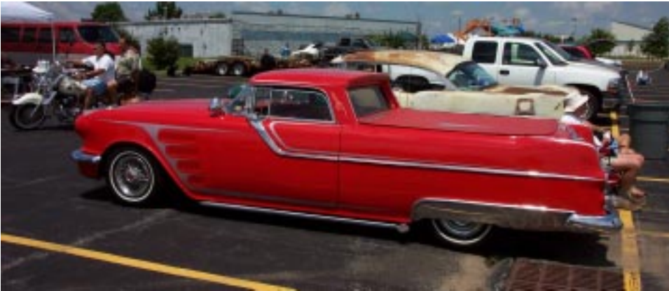
Left: An interesting chopped and converted '55 Safari. This modified was called a Rancho.