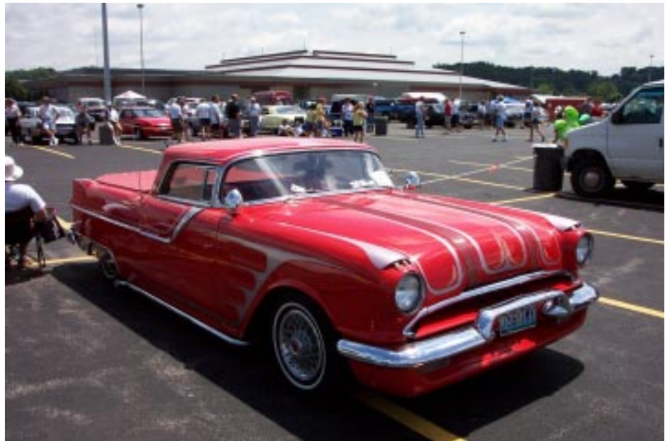
Right: Not sure if I could do this to a Safari. Notice the rear bumper bar connecting the front bumper pieces. The hood stainless was sheet metal screwed to the hood...ouch!!!!