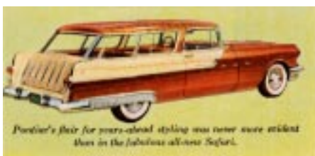
Pony's flair for years-ahead styling was never more evident than in the fabulous all-new Safari.

On the car front, I was able to add 5 pair of seat belts to my Safari. Drilling the holes was an interesting challenge trying to figure out the "perfect spot" and dodging some "soft spots" in the floor. But now I can actually put more than the 103 miles I put on it last year. Even running back and forth to Wal-Mart is more fun with the kids in the Safari than a minivan. I also added new rims and radial wide-whitewalls to eliminate the rattling and shaking I had whenever I went more than 55 mph. My next project is to figure out how to align the tailgate window so that water doesn't pour in whenever it rains. If anyone has experience with this problem or any ideas, please let me know.