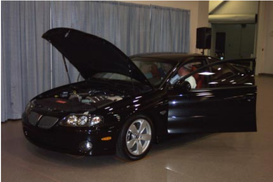
Above: 2004 Pontiac GTO. From all reports great on performance, lacking in style. I'm sure there will be some aftermarket accessories, ie., hood tach that will be available. Below: Paige Pye thinks she's getting a new 2004 Pontiac Grand Prix for Christmas..... maybe a Hot Wheels Version!!