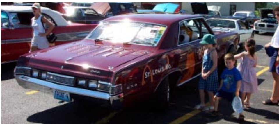
Left: This was a backwards car or back in front car. Notice the headlights above the rear bumper and the rear wheels turned to the left. It had wide tires in the back and taillights where the headlights used to go. Some people have too much time on their hands!!