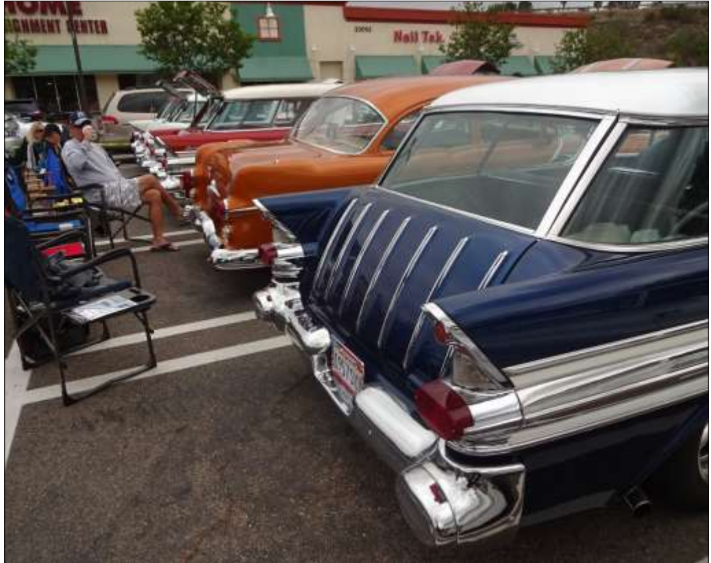
Above: Four Safari wagons with a '55 sedan. Cool!

Everyone had a great time and appreciated the support of Duke's Café who helped sponsor the event. Duke's offered a discount on their fine food for POCI members.