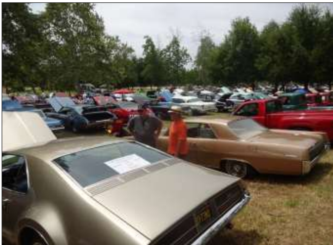
Above: Our Chapter Display set-up by Tom Young