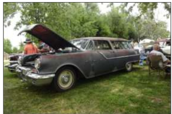
Bottom: A beautiful modified '56 Safari wagon owned by Ed Rogers. His Safari is road ready!